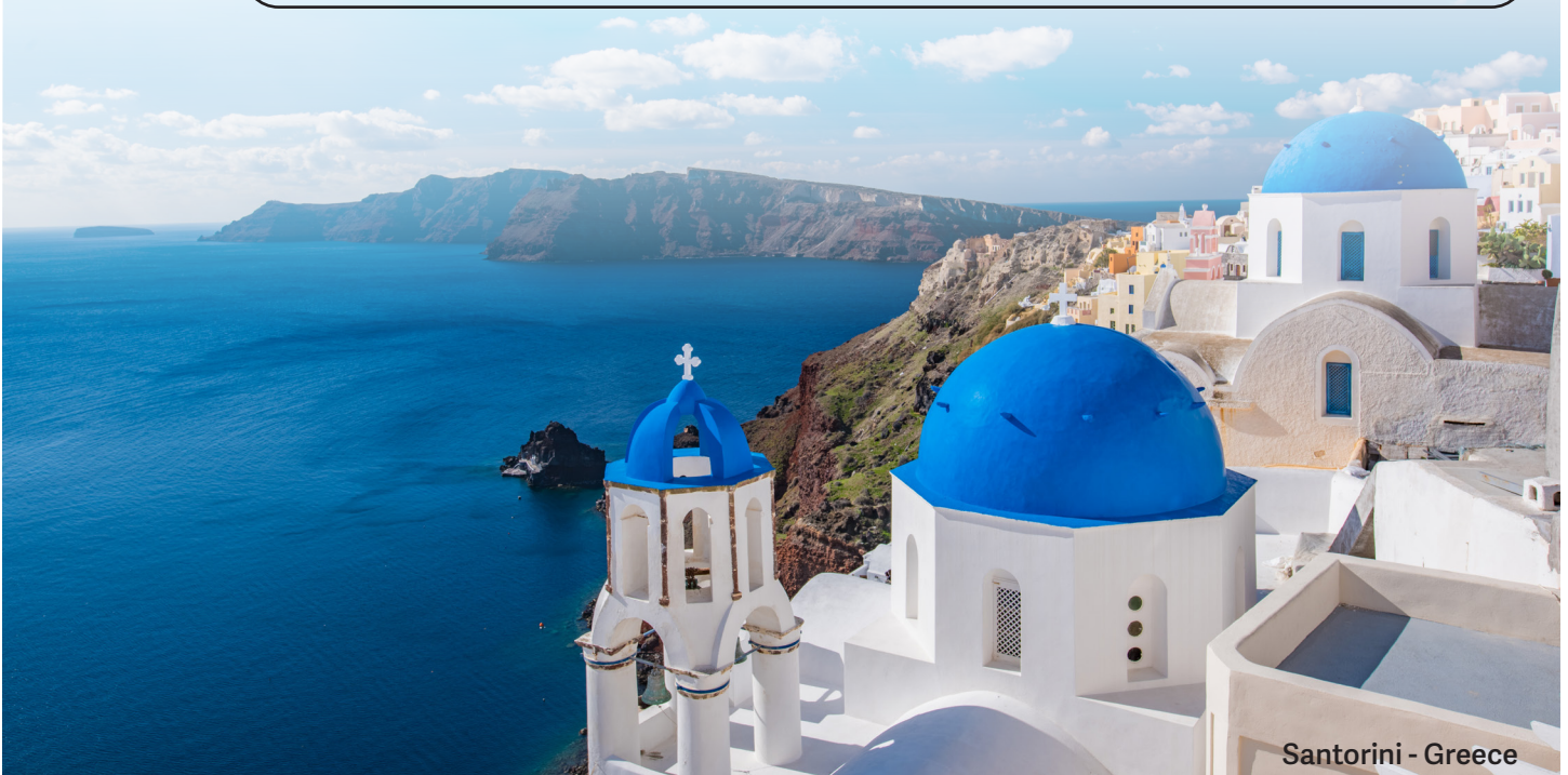
Santorini - Greece

All priests leading a pilgrimage may have their basic expenses covered, including airfare, fuel surcharges, hotels, ground transportation, breakfasts, dinners, tips, tickets, and taxes. Each priest is responsible for their standard incidentals that could include additional beverages, bottled water, personal charges added to their room (e.g., internet and phone charges, laundry, additional meals, etc.), personal purchases (e.g., souvenirs, religious items, books, food, medicine, etc.), public restroom costs, and other personal expenses.