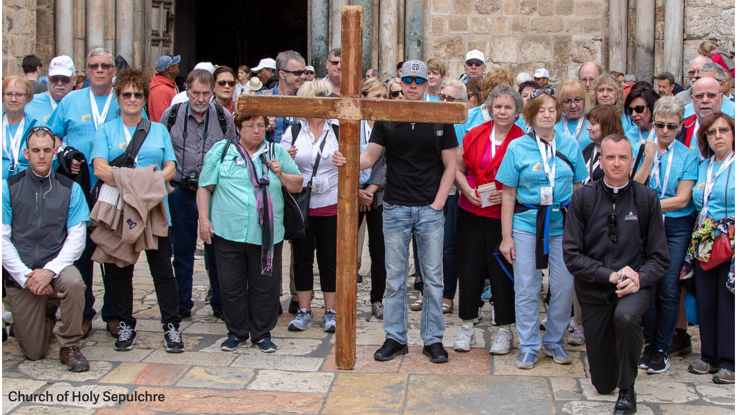
Church of Holy Sepulchre

In the divine tapestry of life, you've been summoned by a higher calling. God has entrusted you with important work- a life challenge, indeed. Your mission? To nurture every soul within your parish, guiding them towards a profound closeness with Christ. Yet, amidst the complexities of modernity, many of your parishioners find themselves adrift, feeling disconnected both from their spiritual home and from the guiding presence of their pastor. But fear not, for there is hope on the horizon. We stand ready to walk alongside you in this sacred pilgrimage.