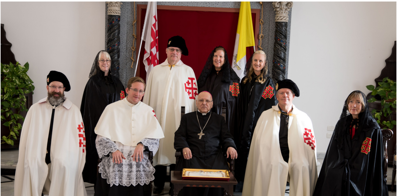
Latin Patriarchate of Jerusalem with H.B. Patriarch Emeritus Michael Sabbah

All of us here at L. P. Pilgrimages, work tirelessly to ensure that your pilgrimage is a carefree, successful and enjoyable experience from start to finish. We pride ourselves on attention to detail with your travel plans, air transportation, accommodations, specialized inclusions and ground assistance. Along with our travel insurance partner, we aim to secure your health, safety, and financial protection. With guidance in pre-tour preparation, risk assessment and planning, you will be benefitting from a wealth of collective knowledge and experience. Our tour escort will meet you at your arrival city and stay with you throughout your pilgrimage until you return to the airport for your flight home.